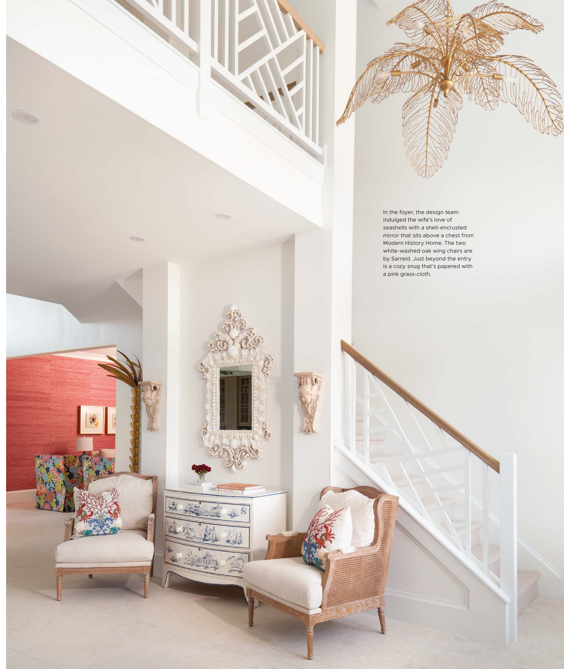
In the foyer, the design team indulged the wife’s love of seashells with a shell-encrusted mirror that sits above a chest from Modern History Home. The two white-washed oak wing chairs are by Sarreid. Just beyond the entry is a cozy snug that’s papered with a pink grass-cloth.