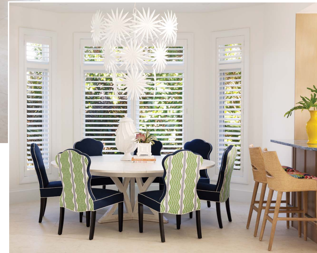
RIGHT: The Currey & Company Bismarkia chandelier was one of the first items Fogarty and the wife found when shopping together at High Point in North Carolina. It now crowns the dining area above a table by Sarried and chairs by Designmaster Furniture.

purple room, and the pink room due to the color of their walls," says Fogarty. "We decided to keep the names, but not drench the rooms in those colors as they'd once been. Instead, we chose colorful headboards and repeated the color in the fabric."