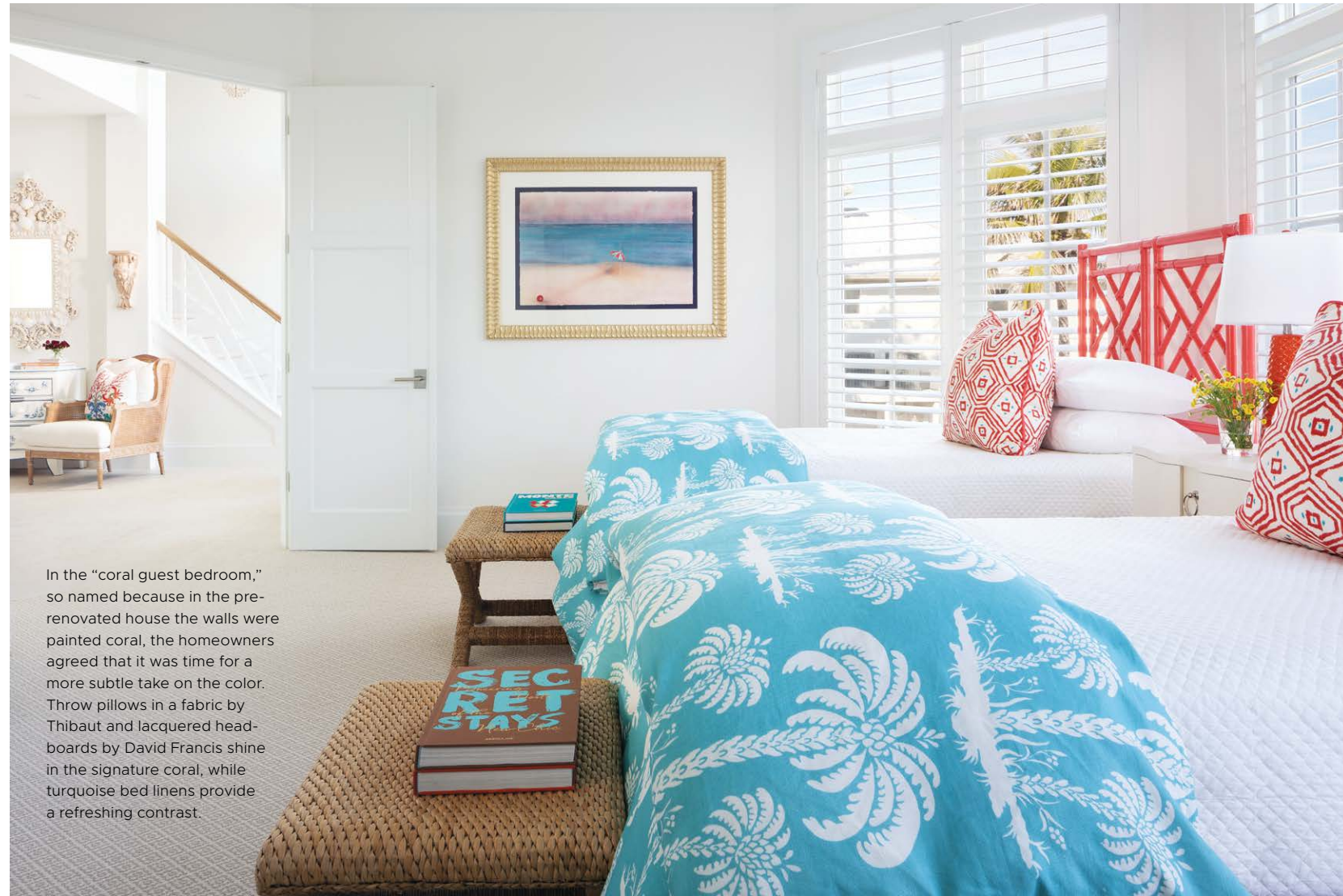
In the “coral guest bedroom,” so named because in the pre-renovated house the walls were painted coral, the homeowners agreed that it was time for a more subtle take on the color. Throw pillows in a fabric by Thibaut and lacquered headboards by David Francis shine in the signature coral, while turquoise bed linens provide a refreshing contrast.