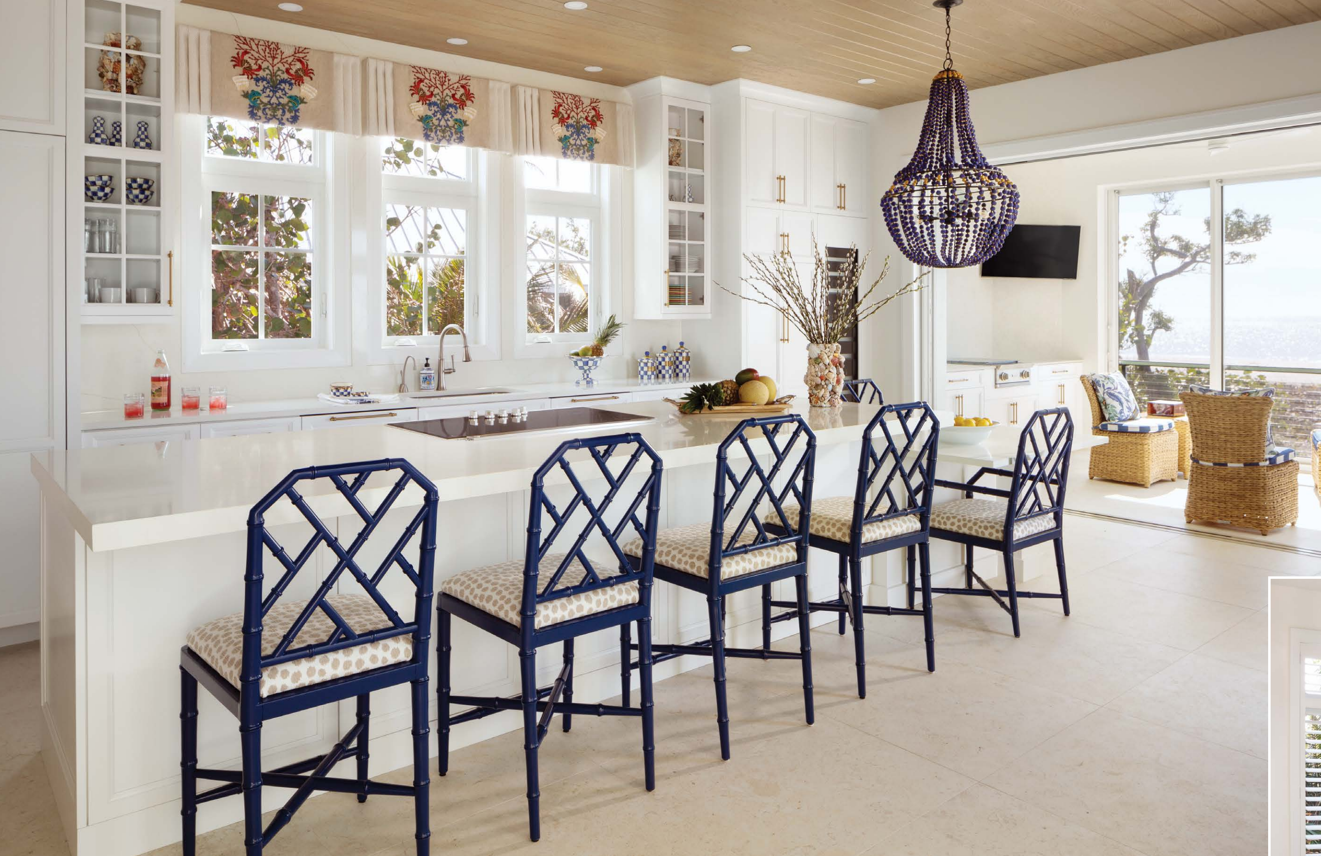
LEFT: In the kitchen, Fogarty recommended adding windows for more natural light and extending the island to increase surface area and seating. As the yin to the white counters and cabinets' yang, the designer chose a rich navy for the Villa and House counter stools and table chairs. A navy beaded chandelier from Currey & Company hangs over part of the island.